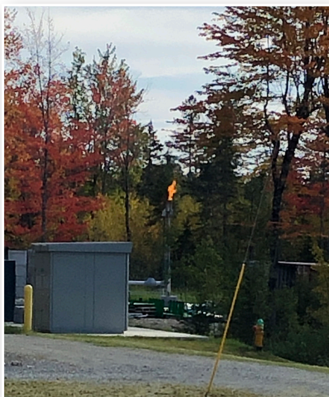
The AD flare was lit and marks the start of the admission of biomass and gas production.

During a scheduled outage from October 4-7, Coastal Resources and multiple contractors were able to produce results that are important to full operations sustainability. It was an inconvenience to our members to not have Coastal Resources available however the MRC is pleased that the outage was productive and significant progress was made toward the commissioning of the plant. Acceptance testing of the Coastal facility is scheduled to commence on October 21 and expecting to wrap up the week of October 28.